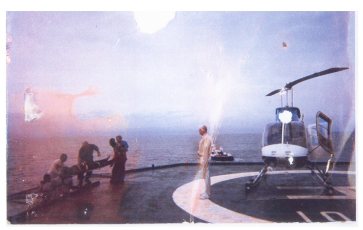
May 28, 1998: Protester shot by soldiers is being carried to helicopter after the attack on the Parabe Platform.

"On the Parabe Offshore Platform incident, he said the occupiers, contrary to the suit's allegations, were armed with machetes, knives and clubs and were de-