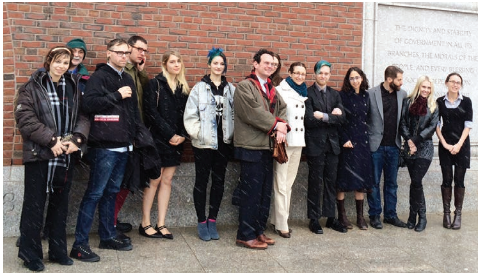
CCR legal team and plaintiffs in Blum v. Holder , along with animal rights activists, after February 3 argument in Boston.

The day ended with "From Terrorism to Activism: Moving from the Green