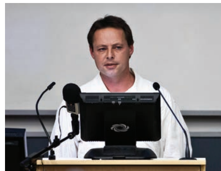
David Hicks speaking in 2012.

Watch videos about our Gitmo work at www.CCRjustice.org/gitmo