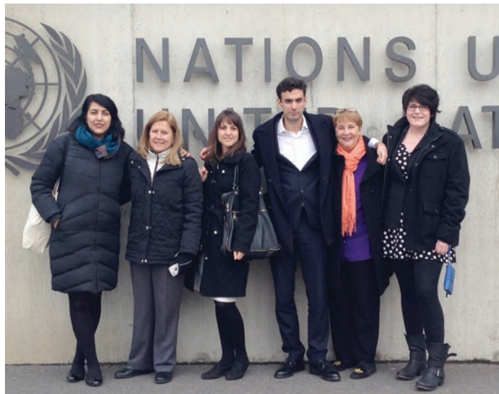
CCR and SNAP team at the UN Committee on the Rights of the Child hearing in Geneva.

CCR and SNAP will also be submitting a report to a