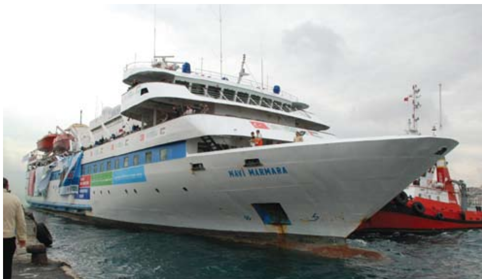
Gaza flotilla ship, the Mavi Marmara , displaying a banner that reads: “This is a humanitarian aid ship” in four languages.

In June, CCR asked the U.S. State Department to join other nations in calling for an independent inquiry into the attack by an impartial tribunal, and to demand that Israel immediately release the property it still holds—including cameras, video equipment, cell phones and computers that can help document the assault. And on