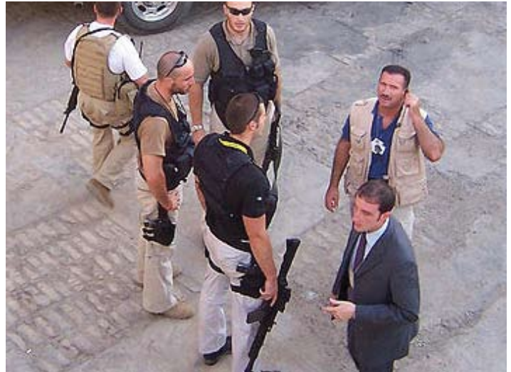
Blackwater Security guarding U.S. State Department employees

We are now working to preserve this win in Al-Quarashi before the Fourth Circuit. Meanwhile, in our first-filed Iraqi torture case, we just received notice from the U.S. Supreme