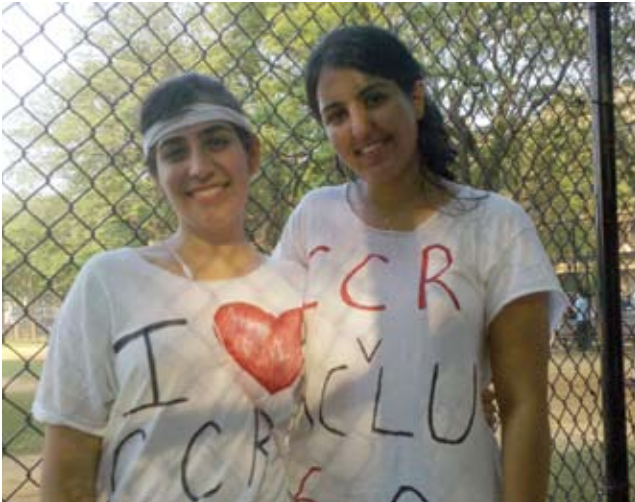
Two Ella Bakers at CCR's annual kickball game vs. the ACLU.

CCR's Ella Baker Program was created to honor of the fearless civil rights leader, Ella Baker, who believed in training young leaders involved in social justice movements, to carry on the struggle(s) in future generations. Because of Ella, CCR holds as part of its mandate a duty to: "to train the next generation of constitutional and human rights attorneys" and does so each summer through our Ella Baker Program, a summer internship program for social justice advocates from law schools and universities across the country.