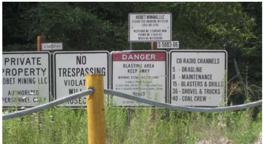
Mountain-top removal coal mine with signs threatening trespassers with prosecution.

delegation to meet with community organizers in West Virginia opposing mountaintop removal (MTR) coal mining—a process that is deeply destructive to the environment, and to the people who live in the Appalachian mountain valleys where it is taking place. Some activists have chosen to trespass onto company land to bring much needed attention to this critical issue, and these activ-