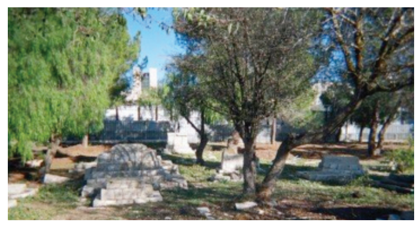
1: What remains visibly intact of the Mamilla cemetery abuts the fence surrounding the Museum construction site.