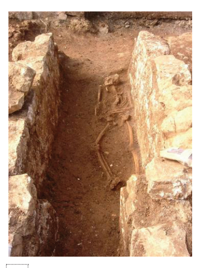
2: A complete human skeleton exposed on the Museum site. This particular grave belonged to an important individual, as evidenced by the monumental walls of the tomb.

1: Human bones of individuals buried in the Mamilla cemetery that were disinterred on the Museum site reveal fresh new breaks. This photo shows the unceremonious and disrespectful manner in which the remains were dug up and placed in boxes. The location of these remains is currently unknown.