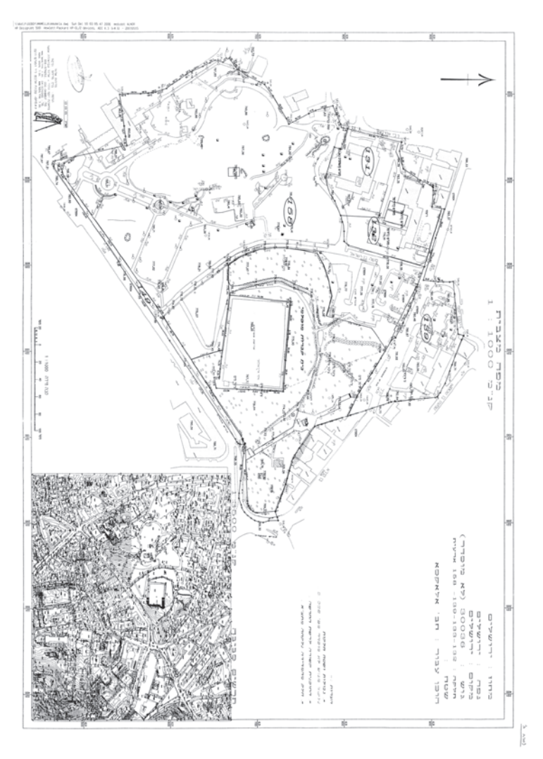
D. 2006 map showing the Mamilla Cemetery divided into various plots, including 158, constituting Independence Park, 131 and 132, where a school and playing field have been erected, 139, where an underground parking lot and other structures have been constructed, and the unmarked area just south of plot 139, where the boundaries of the Museum construction site are highlighted. The eastern portion is marked "Muslim Cemetery," which is what remains visible of the ancient cemetery and its historical structures, including the Mamilla pool in the center.