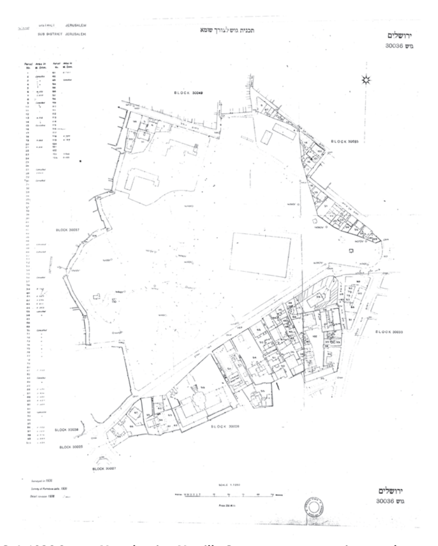
C. A 1936 Survey Map showing Mamilla Cemetery as one contiguous plot, without any modern structures built within its boundaries.