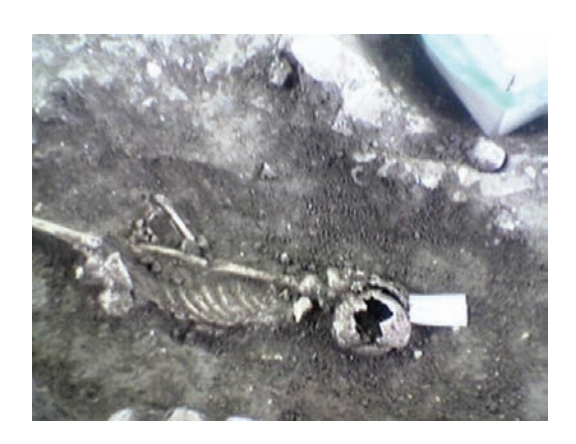
3: An exposed human skeleton with a cracked skull on the Museum site.