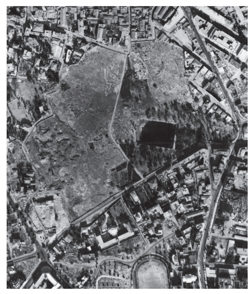
A. 1951 aerial photograph of Mamilla Cemetery showing the entire cemetery intact, without any development on it.